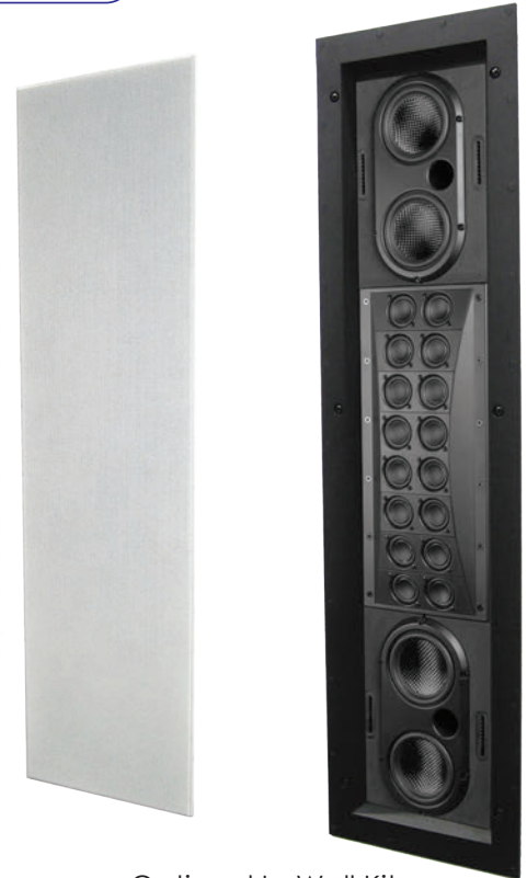
Optional In-Wall Kit